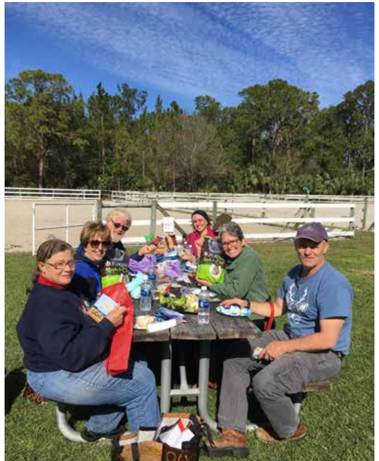
Lunch with organizers and drivers.