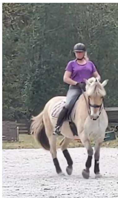
working on haunches in

2. Different muscle groups get worked through lateral work. This really helps when you are moving up into collection and extension. A few steps of haunches in into a lengthening, or later on, into a medium trot will really help! As you move out of the haunches in, you can feel the power behind. Instead of starting out with fast feet, you start out with strong thrust. What a great "bridge" to teach your horse that more power, not faster feet is what you are asking for!