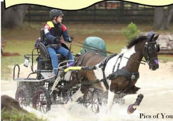
Pics of You

Florida Whips Members Are Eligible for End of Year High Point Awards!! Join Today !!