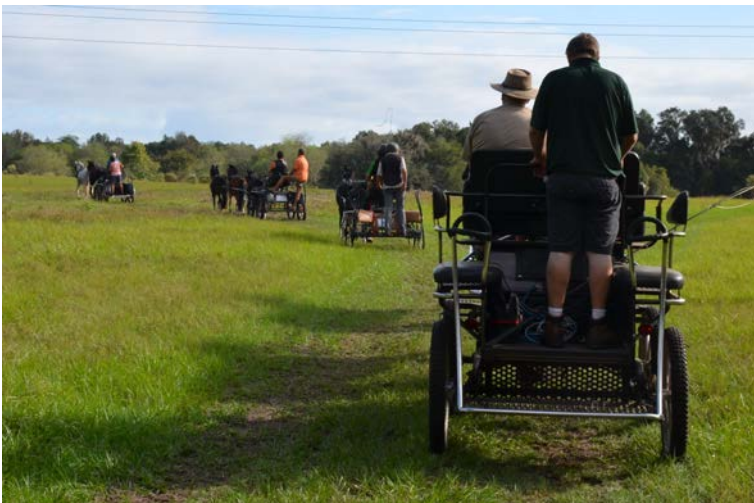
The group heads out on the 7K drive