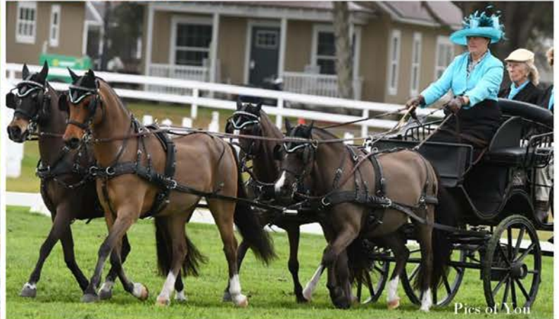
Pics of You

Florida Whips Members Are Eligible for End of Year High Point Awards!! Join Today !!