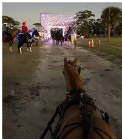
Scarlet taking in the lights.