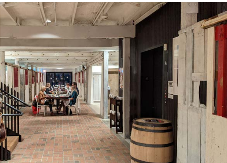
Has your horse stabled in Barn 8? It's changed! #barn8

A HUGE highlight of this event was Hermitage Farm's on-site restaurant, Barn8. It was superb! The restaurant is a beautiful renovated horse barn with contemporary art displayed throughout. It's a farm to table restaurant with a bourbon library, a greenhouse to supply the vegetables, and a farm store where we bought our boxed lunches. These weren't your mother's boxed lunches, but exquisite cuisine that included chilled sweet corn soup, butternut squash bisque, etc. all locally grown. The bison and chickens are also located and raised on Hermitage to provide protein for Barn8. The highlight