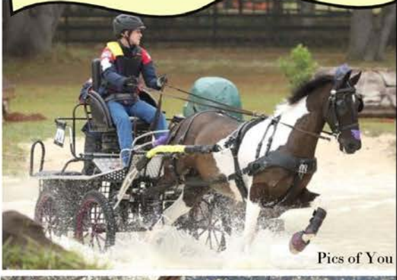
Pics of You

Florida Whips Members Are Eligible for End of Year High Point Awards!! Join Today !!