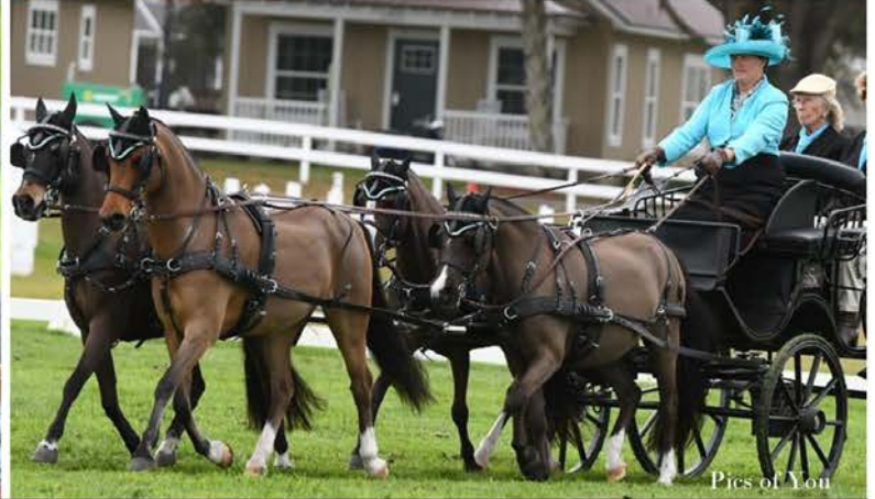
Pics of You

Florida Whips Members Are Eligible for End of Year High Point Awards!! Join Today !!