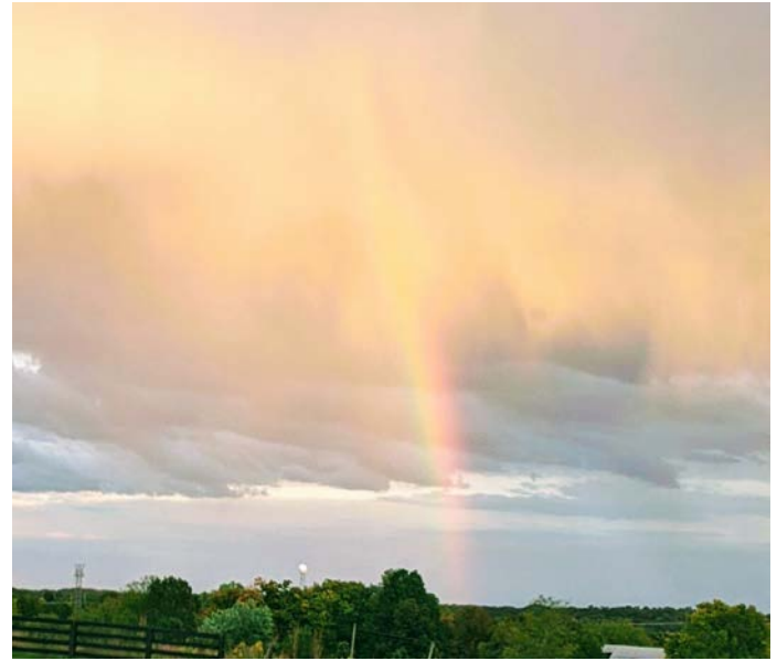
A rainbow the night before dressage is a good sign, right?