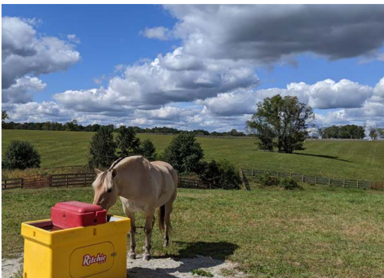
Xander gives showing in Kentucky a 10 out of 10 (above), beautiful views for dressage (right)