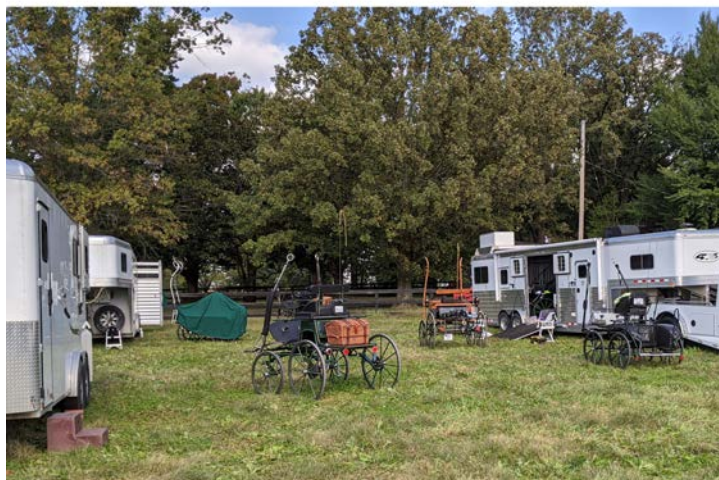
after dressage and cones it's just an explosion of presentation carriages... Everyone's walking the hazards!