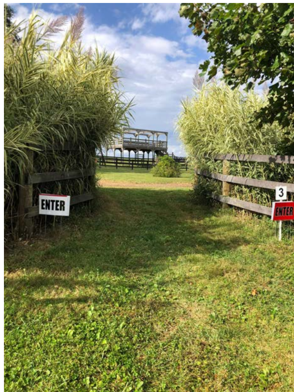
water hazard entrance with viewing tower in the background